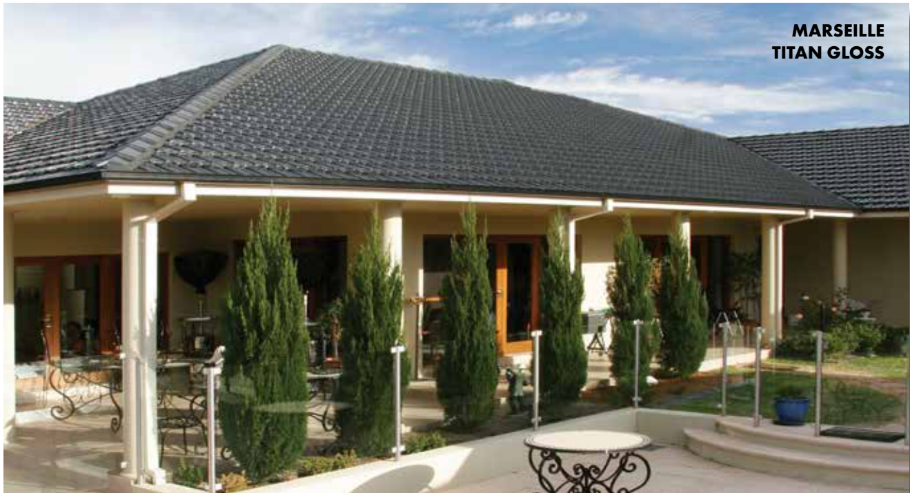
MARSEILLE TITAN GLOSS