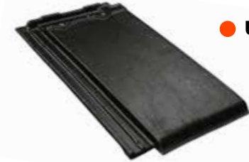
● URBAN SHINGLE