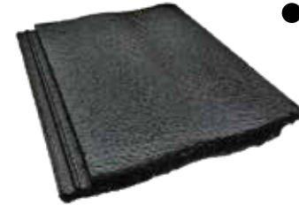
● TRADITIONAL RENOVATION RANGE