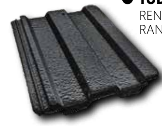
● TUDOR RENOVATION RANGE