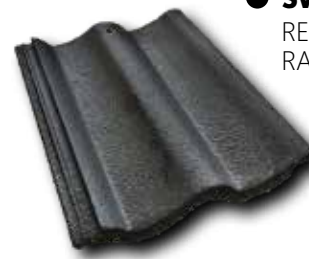
● SWISS RENOVATION RANGE