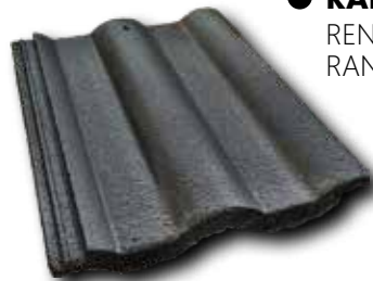
● RANCH RENOVATION RANGE